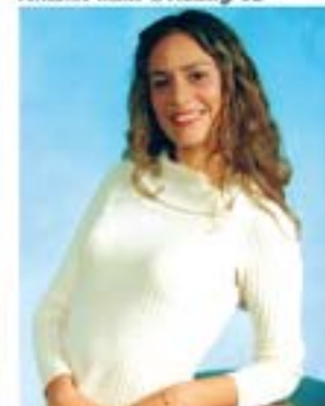
AR373 IRIS (28) HON 5'7 123. Systems Engineer. Swimming, dancing, watching TV & outdoor activities. GE