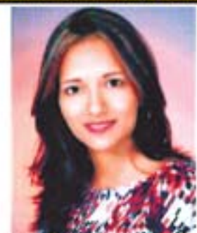
AR362 CAROLINA (28) COL 5'5 130. Doctor's employee. Likes a good massage at the end of the day. 1 child