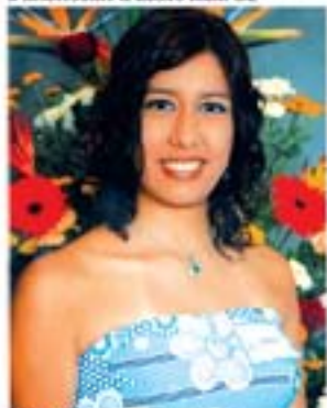
AR375 DIANA (25) PER 5'3 117. Publicist. Spending time with friends. Seeks a respectful & sensitive man. GE