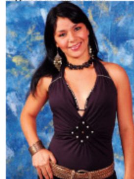
AV149 CAROLINA (25) COL 5'3 106. Student. Enjoys a healthy lifestyle. Meet a compatible partner 25-50. SE.