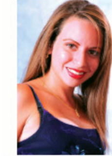
AV137 LADY (21) COL 5'2 110. Student. A loving home with a hardworking & romantic man 25-45. 1 child. SE.